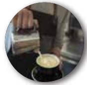
Coffee Shops & Cafés