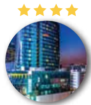
4 Star Hotel